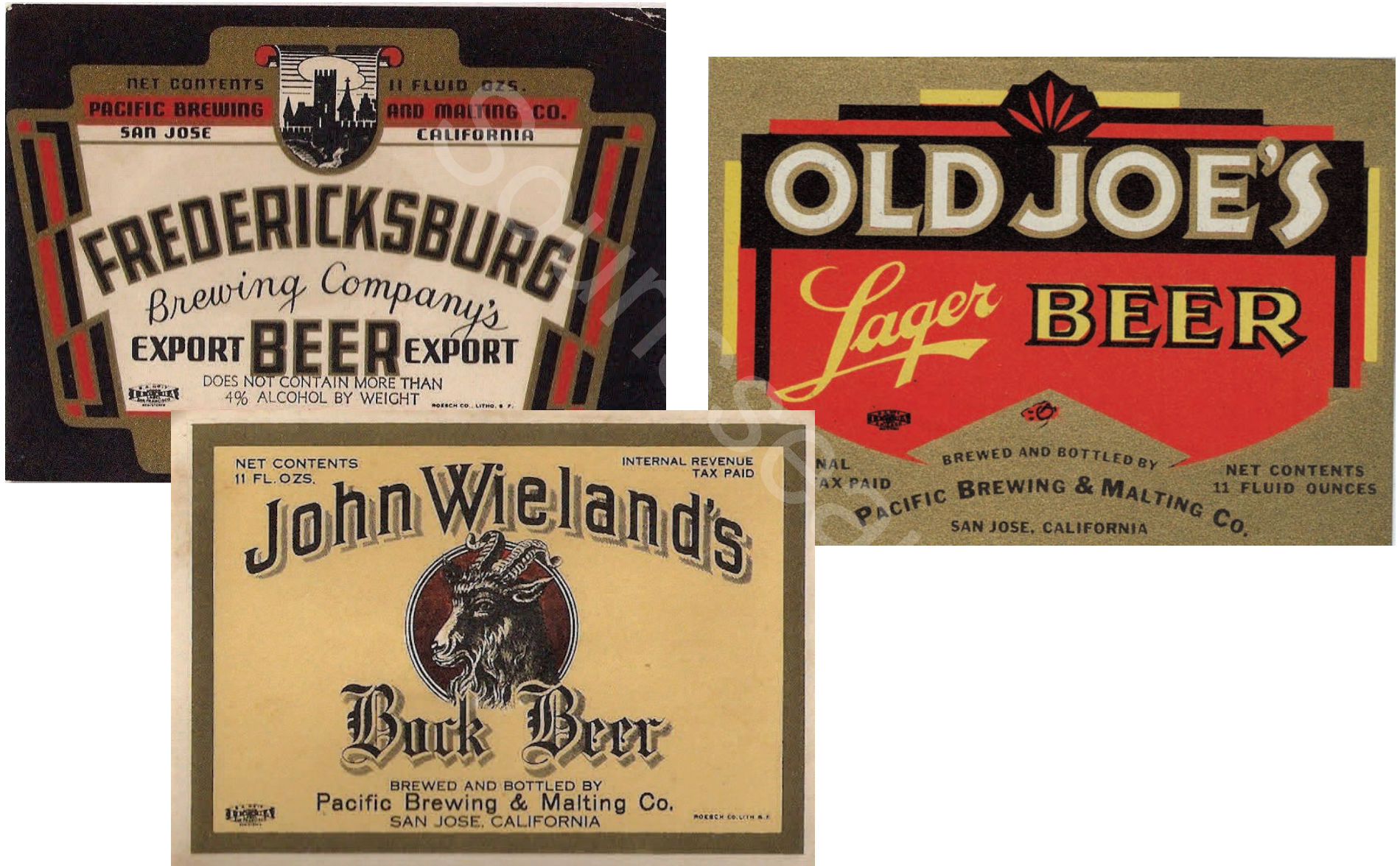
[109] Beer bottle labels: Fredericksburg , Wieland and Old Joe's

Images on file at the Smith-Layton Archive, Sourisseau Academy for State and Local History September 2015