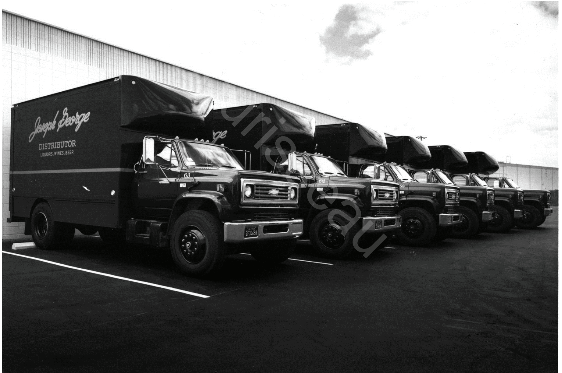
[112] Fleet of Joseph George trucks Spotless dark-green Joseph George delivery trucks supplied retailers throughout northern California.