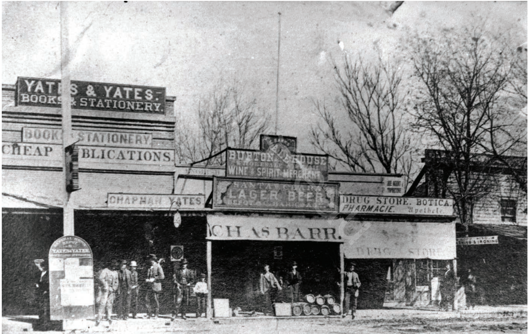
[101] Burton's Ale House

Other breweries were soon established; and by 1868, Santa Clara Lager beer could be enjoyed at Burton's Ale House on South First Street. Cold storage "lagering" was necessary for the fermentation and preservation of lager beer and was at first made possible with blocks of ice cut from frozen lakes in the Sierra Nevada Mountains.