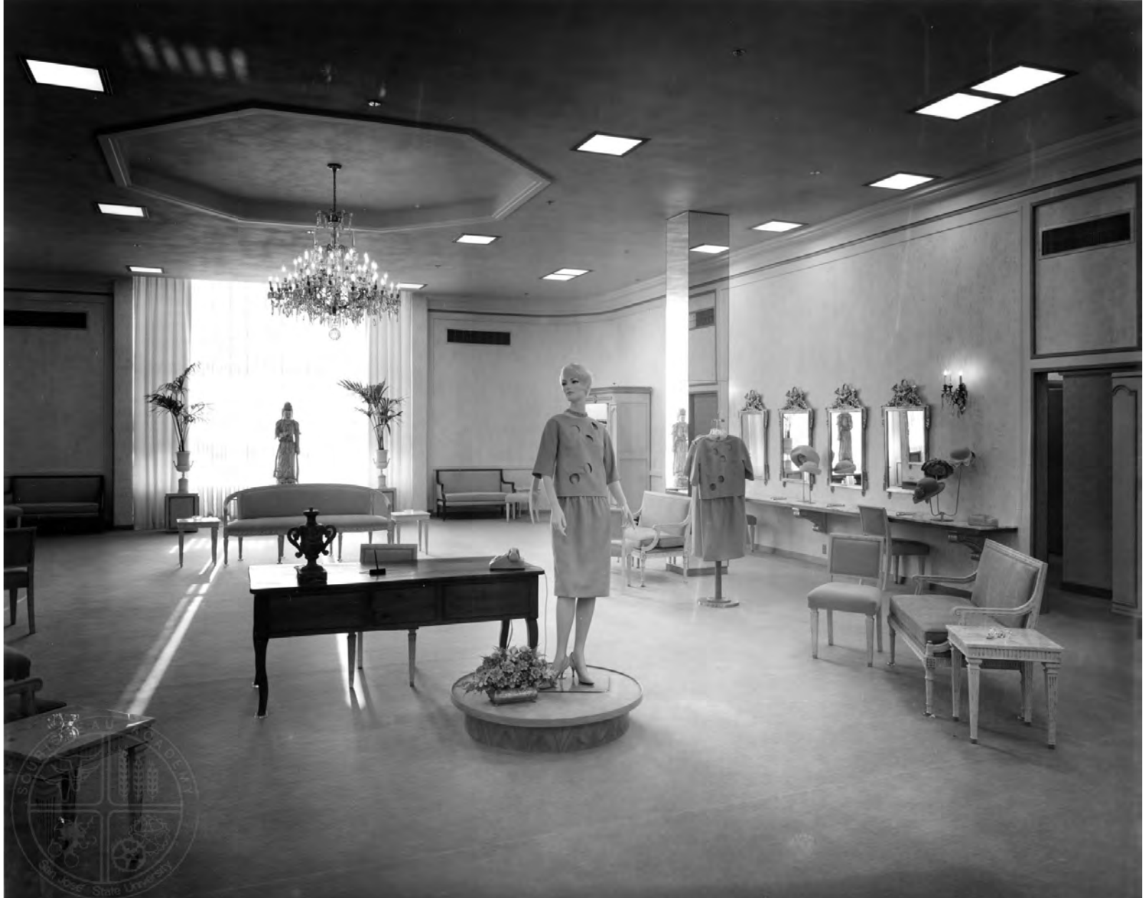
[65] Women's Personal Shopping. I. Magnin took shopping to an entirely new level, with in-house professional stylists. "Please have a seat, Madame, and your personal consultant will be with you shortly. Our mannequins are outfitted with the latest fashions. Coffee or tea?"