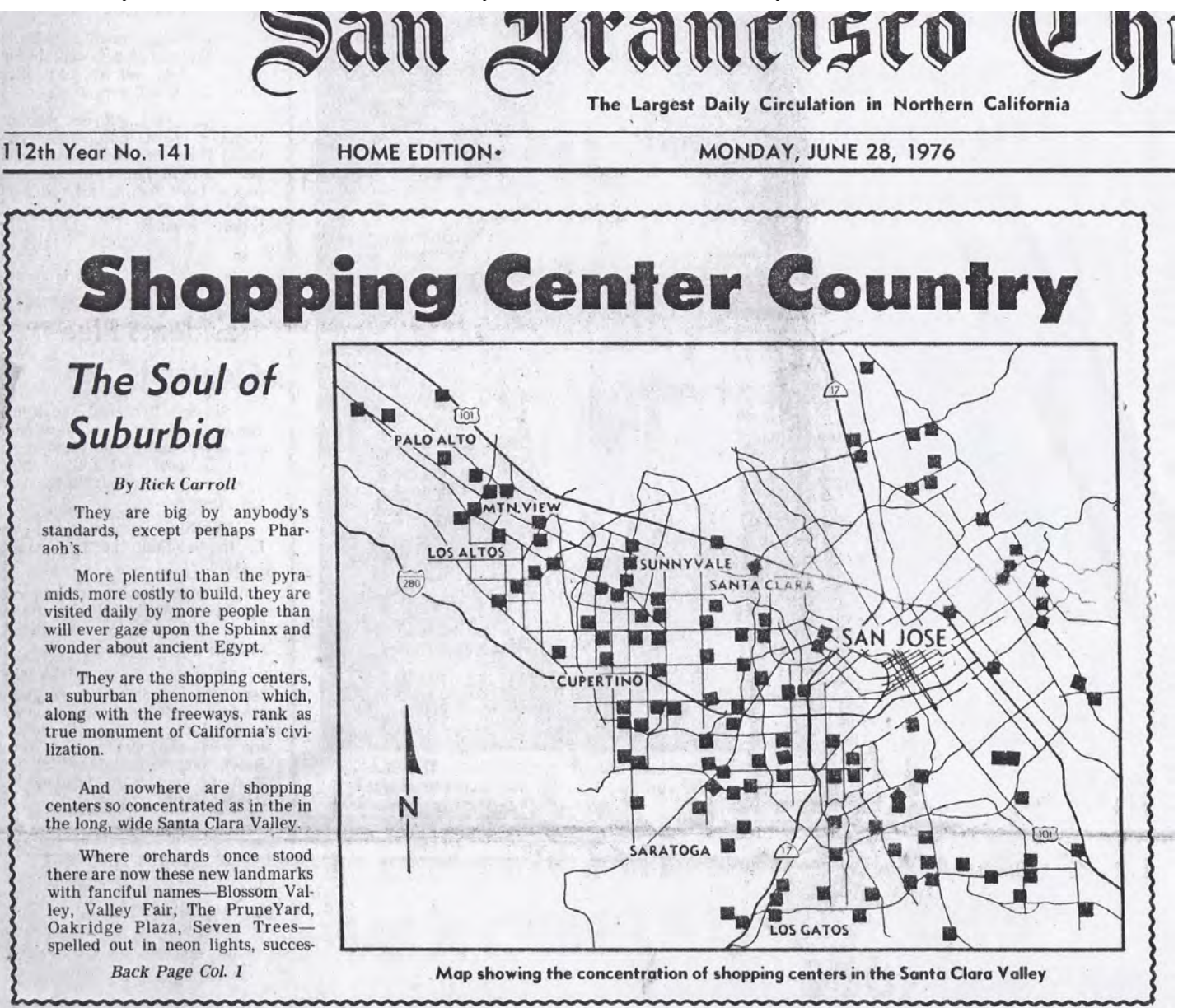
[68] Shopping Center Country. By 1976, the Santa Clara Valley was being referred to as Shopping Center Country . This nickname was not inaccurate. Over the course of two decades, the Valley of Heart's Delight had replaced numerous orchards with dozens of shopping malls and commercial strips. With names such as Blossom Valley , The Pruneyard , and Seven Trees , these modern meccas hardly resembled anything their names implied.