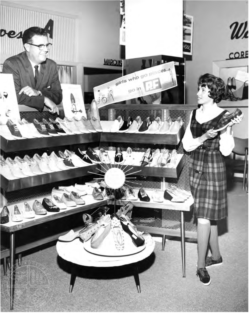
[59] Hart's Shoe Department. Girls who go places shop at Hart's. This circa 1950 photo celebrates one of the many departments at Hart's downtown store – the shoe department. An atomic display fixture showcases a variety of flats for the young miss, as a salesgirl models sneakers that match her dress.