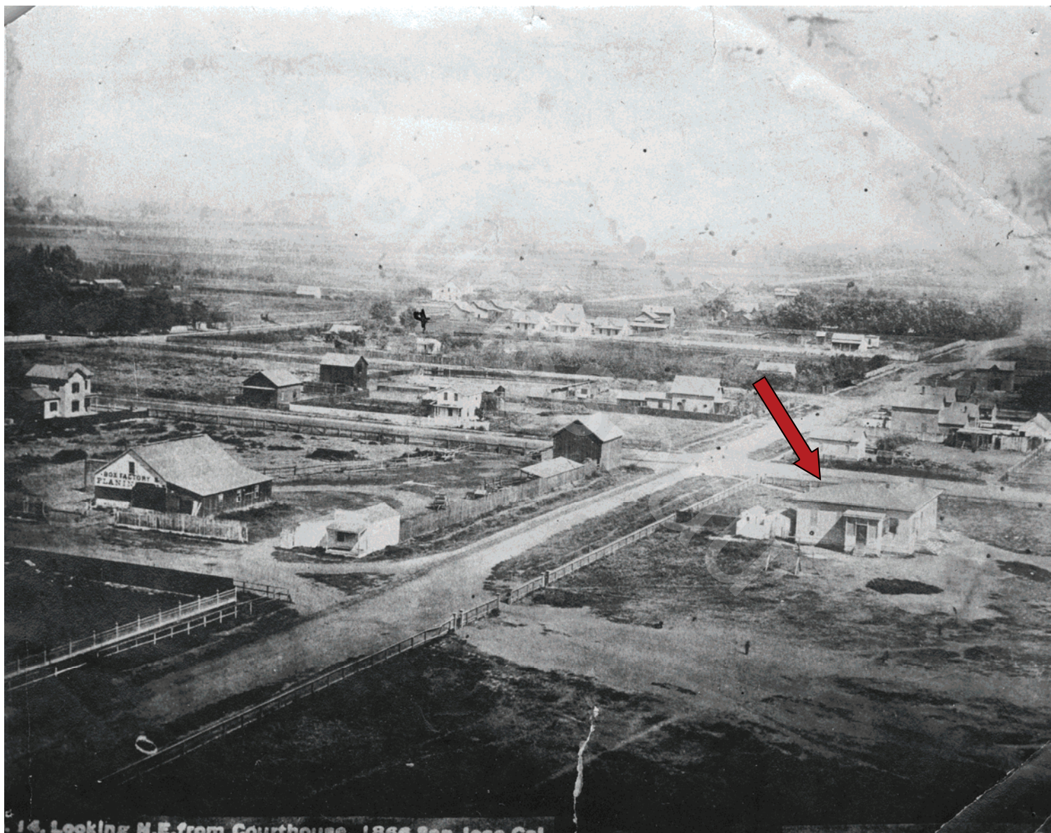
[59] St. James School, 1866. St. James Square remained undeveloped during the first two decades of its existence although a portion of the site was home to Public School #2, called the St. James School until 1869. In 1866, the square was fenced as seen running along the south side of St. James Street.