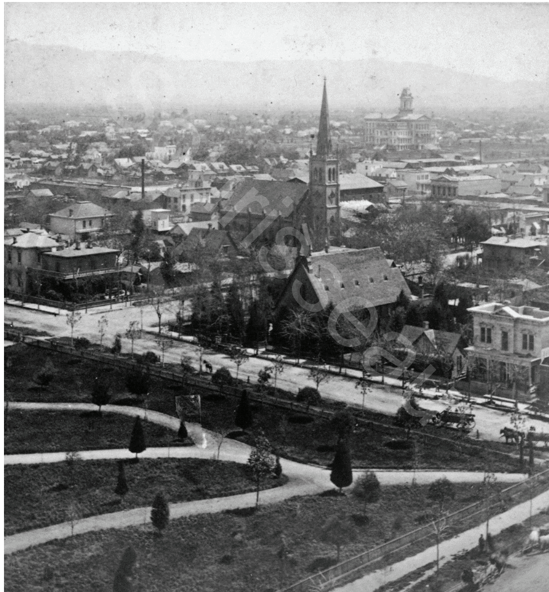
[63] Southeast View from the Courthouse across St. John and Second Streets c1871. By 1870, the City awarded a competitive contract to O'Donnell to fully develop the park, which included a botanical style garden layout of 250 trees, lawn, and pathways. In the distance, the new Normal School built in Washington Square can be seen. The church with the tall steeple was First Presbyterian Church on Second Street.