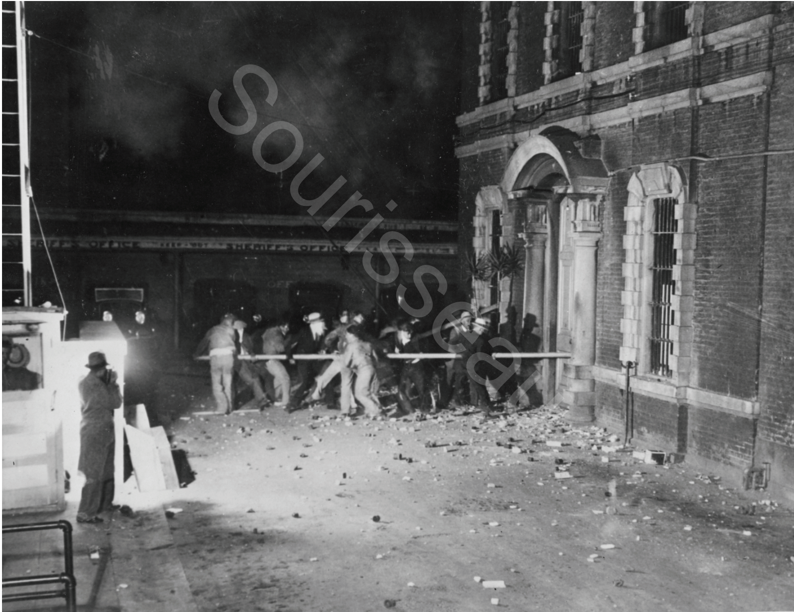
[66] Mob breaking down the door of the jail, November 26, 1933. During the 1930s, a number of significant events occurred within the park boundaries, including two strike rallies by cannery workers, and the infamous lynchings related to the Brooke Hart Kidnapping in 1933.