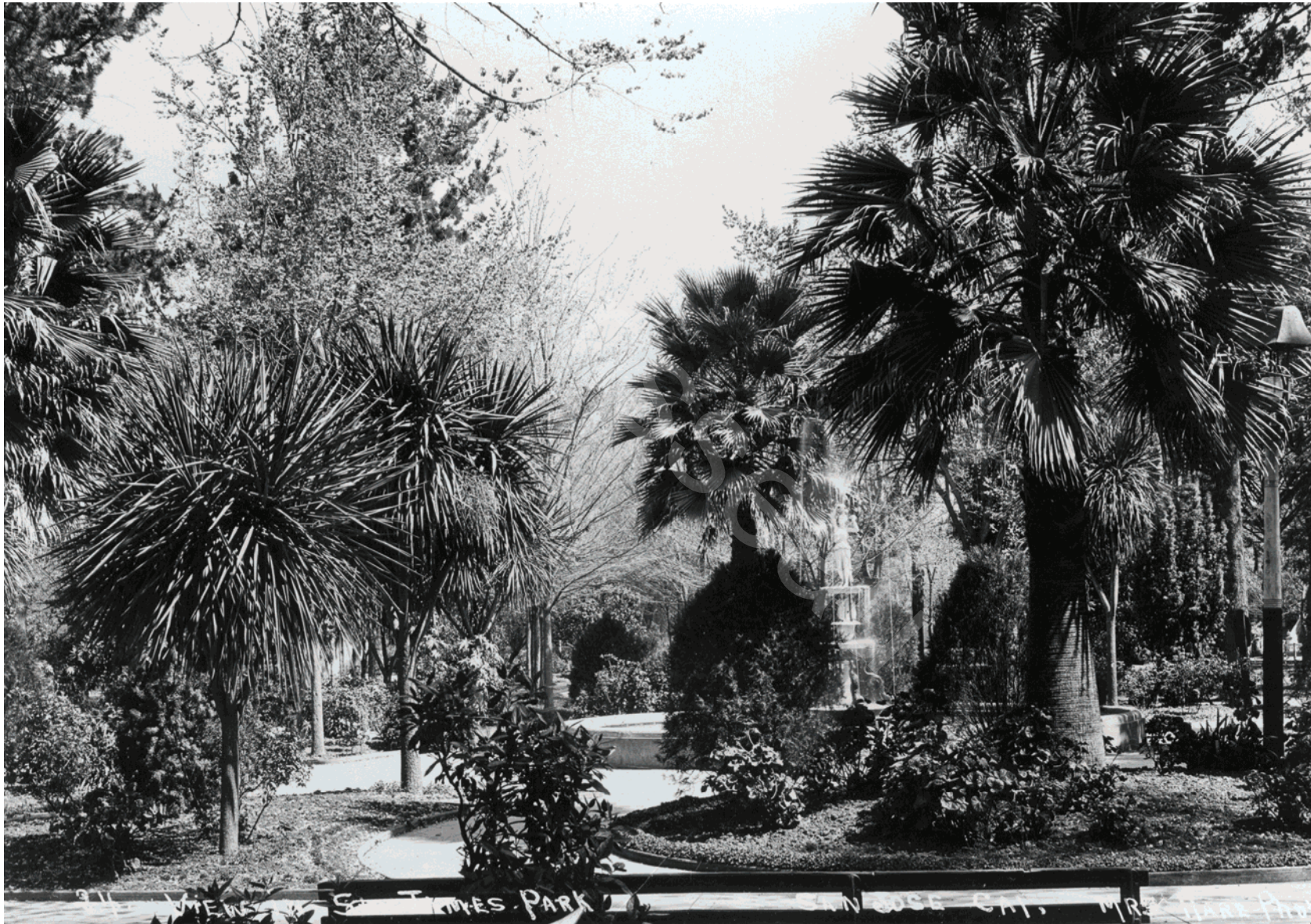
[69] St. James Park, early 1900s. As we reflect on the history of St. James Park from its inception in 1847 until today, it is important to remember that this place is a priceless jewel in the center of San Jose. It is the duty of the citizens of the city to recognize its importance to our history and continue to restore and maintain its beauty as we move forward into the future.