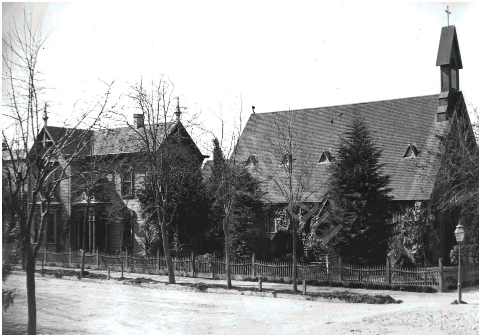
[60] Trinity Episcopal Church. The 1860s brought a building residential building boom around St. James Square. The first major non-residential building was Trinity Episcopal Church, constructed in 1863. City efforts to fully utilize the site began in earnest in 1866 with an unsuccessful proposal to locate the State Normal School within the square.