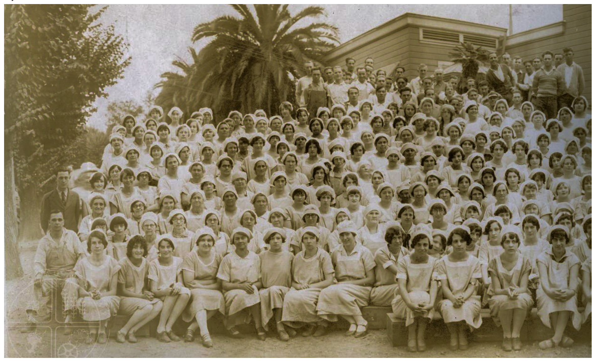
[74] Women Dominate the Cannery Workforce. The need for cannery workers grew with increased fruit orchard acreage. Cannery work was divided along gender, ethnic, and race lines. Chinese men and Anglos filled the initial cannery jobs during the 1870s and 1880s. Following this early workforce, the Italian, Portuguese and Spanish immigrants then dominated the Valley cannery labor force to WWII. By the 1930s, Santa Clara Valley's 38 canneries were the largest employers of women in California. The above photo of the workforce of Richmond-Chase Plant #4 at 380 Stockton Avenue shows the predominant number of women. These women did the "semi-skilled" seasonal hand labor of peeling, cutting and slicing.