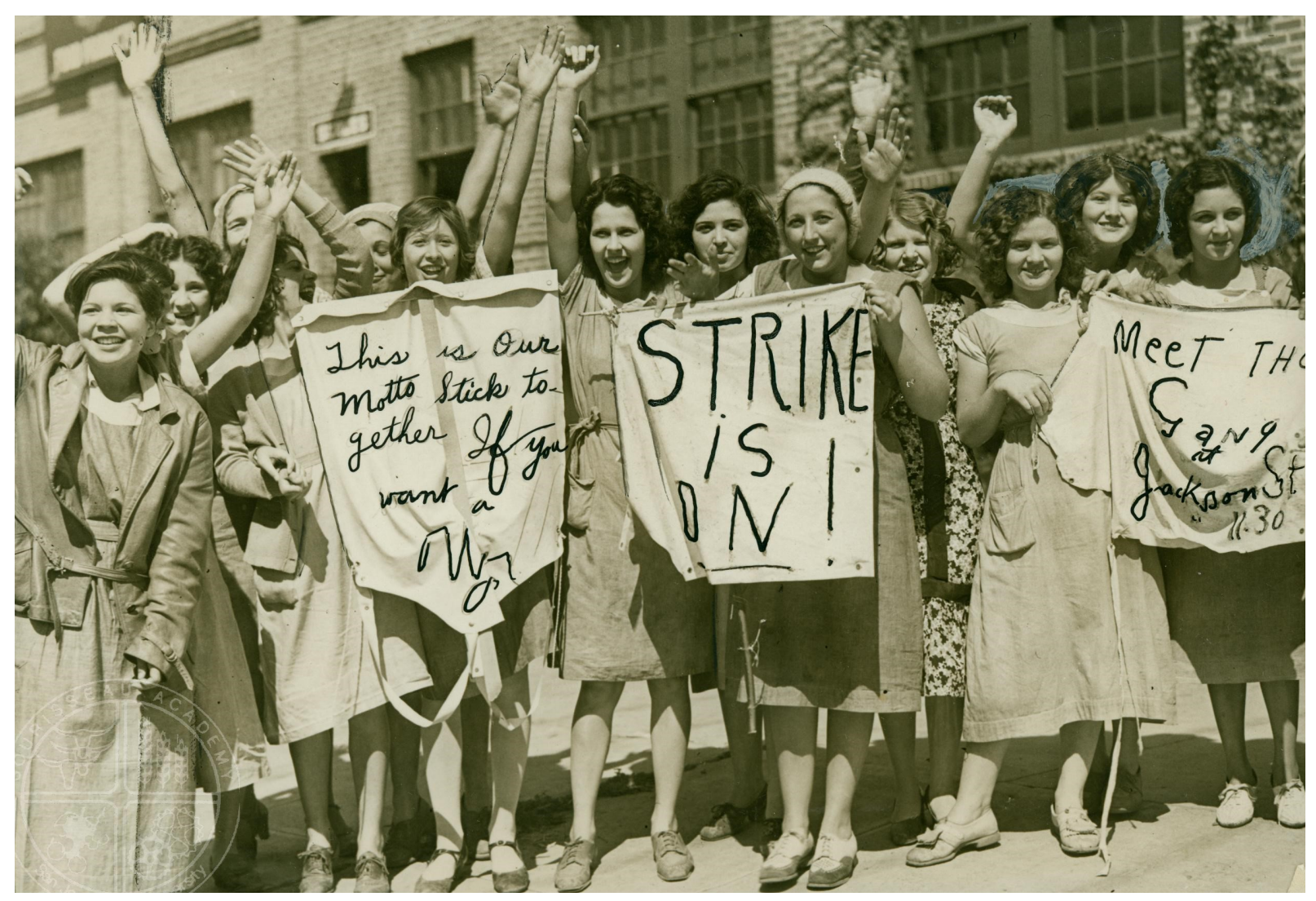
[78] 1930s Unions Made Them Stable. The first Valley cannery strikes took place in 1917 with the American Federation of Labor's Toilers of the World. The Toilers signed a two-year contract that only benefitted male workers. It was not until the 1930s that organized women cannery workers found a union voice. Their first strike took place in 1931 under the Cannery and Agricultural Workers' Industrial Union (CAWIU). This photo shows women striking at Calpak #39 at Jackson and N. Seventh Streets. This strike, the worst riot in San Jose history, took place in St. James Park between police and strikers, ending with the demands of the strikers being met. Since the 1935 federal Wagner Act covered cannery workers, northern California canners joined the California Processors and Growers to seek out "a responsible union" in 1936. The American Federation of Labor (AFL) union filled the need, replacing the "shape up" hiring system with "secure seniority hiring," providing women with job stability and higher earning power.