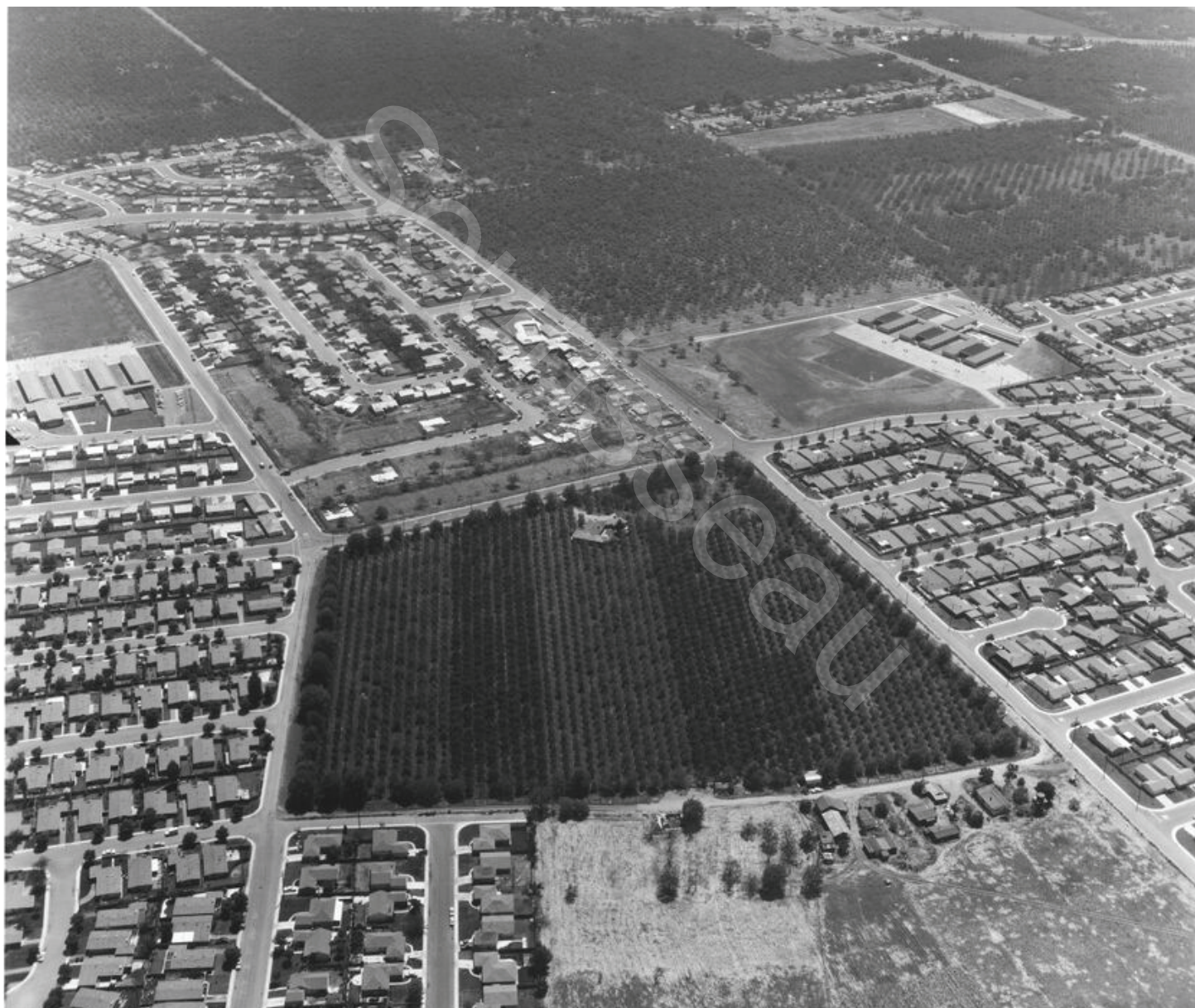
[76] Tract Homes Encroaching on an Orchard. As Post-war Industrial expansion generated thousands of jobs, some of the last working farms succumbed to the demand for housing.

Images on file at the Smith-Layton Archive, Sourisseau Academy for State and Local History July 2015