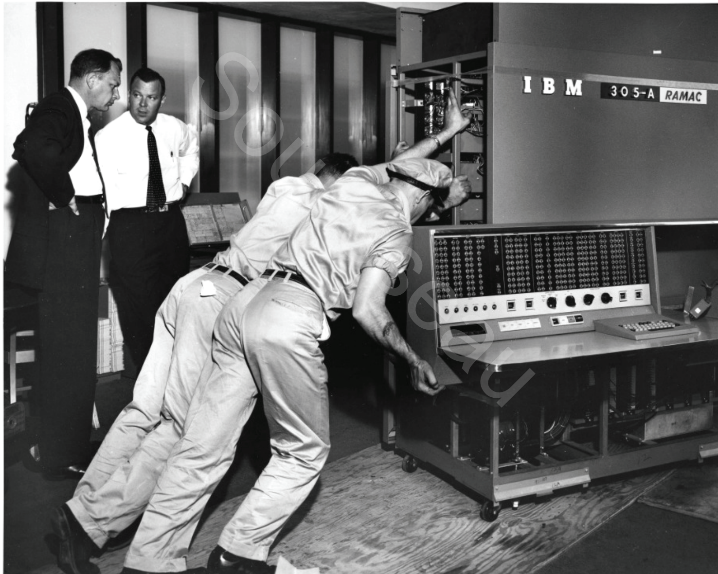
[73] Workers Moving an IBM 305-A RAMAC Commercial Computer. . . . to the completion of a state of the art facility with main frame computers, such as this IBM 305-A RAMAC ready for shipment.

Images on file at the Smith-Layton Archive, Sourisseau Academy for State and Local History July 2015