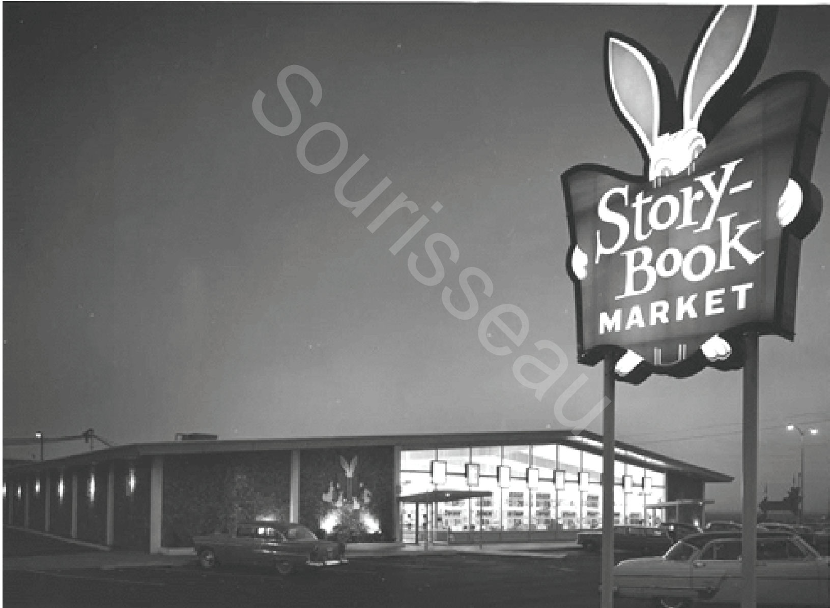
[78] Story-Book Market. The newly arrived citizens to San Jose needed shops, restaurants, and entertainment options, and architects came up with eye-catching modernistic designs. From kitsch to glitz, Del developed techniques to record these over-the-top innovations - such as this night time shot of the Story-Book Market, aptly named for its location on Story Road!