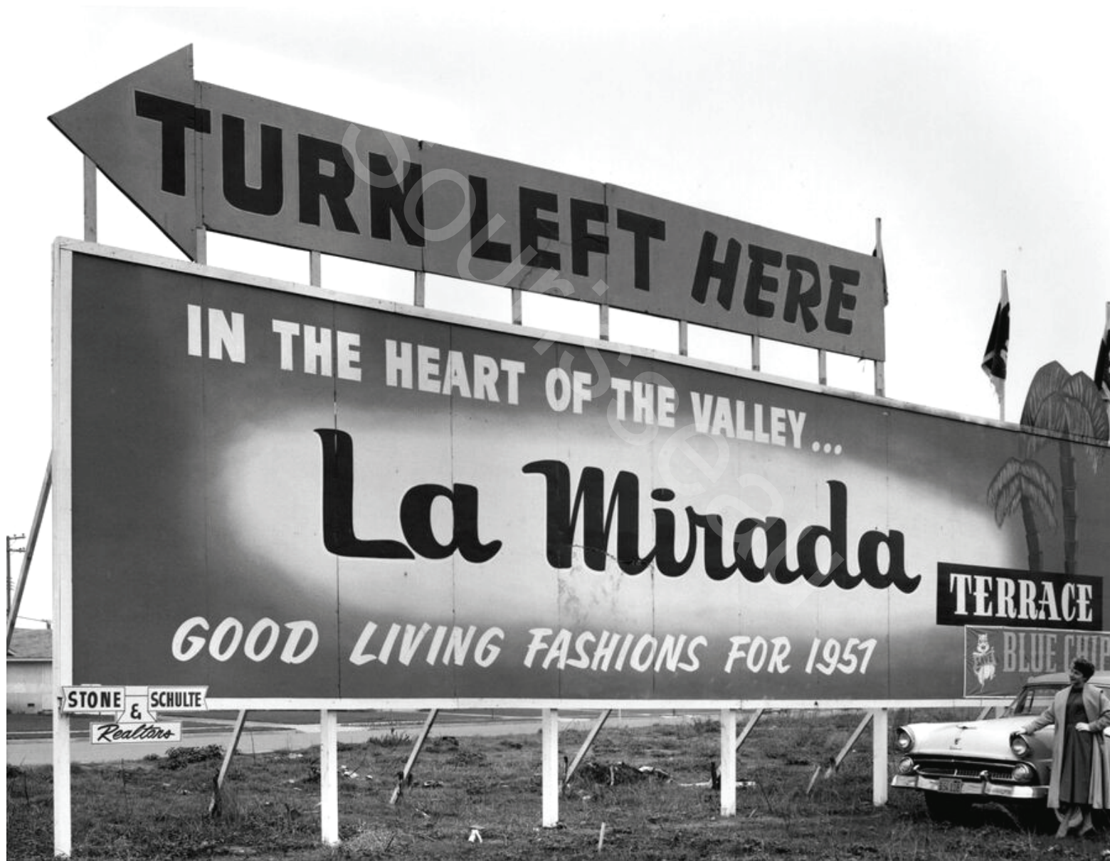
[77] La Mirada Housing Development Billboard, circa 1957. The Valley's flat land, mild climate, and available water supply made it a primary target for residential developers. San Jose soon became one of California's fastest growing cities, and "Del" was there to capture it.