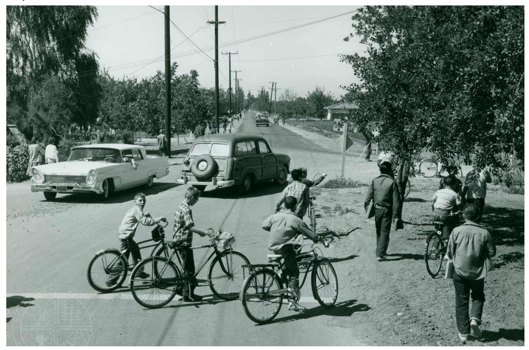
[27] Kids and Their Bikes! The post-war 1950s was a time of rapid growth in the Valley. The City of San Jose began expanding into the county's agricultural areas to meet the demand for housing. The baby-boomer generation kids were everywhere, and the bicycle was their primary mode of transportation. Schools and law enforcement agencies promoted bicycle safety with events and manuals in this adventurous era before the advent of helmets and bike lanes.