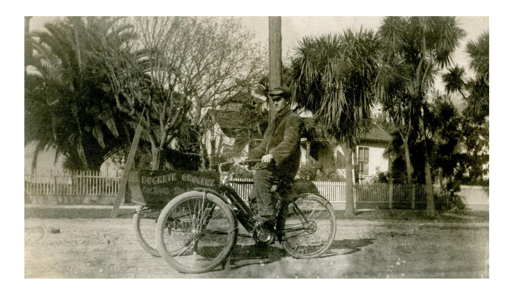
[24] Tricycles. Besides leisure and sport, the bicycle and its tricycle counterpart were soon adapted for transportation and other practical uses. Here is a wonderful photograph of a delivery tricycle for the Buckeye Grocery Store from about 1913. This particular "trike" was manufactured by the Indian Motorcycle Company.