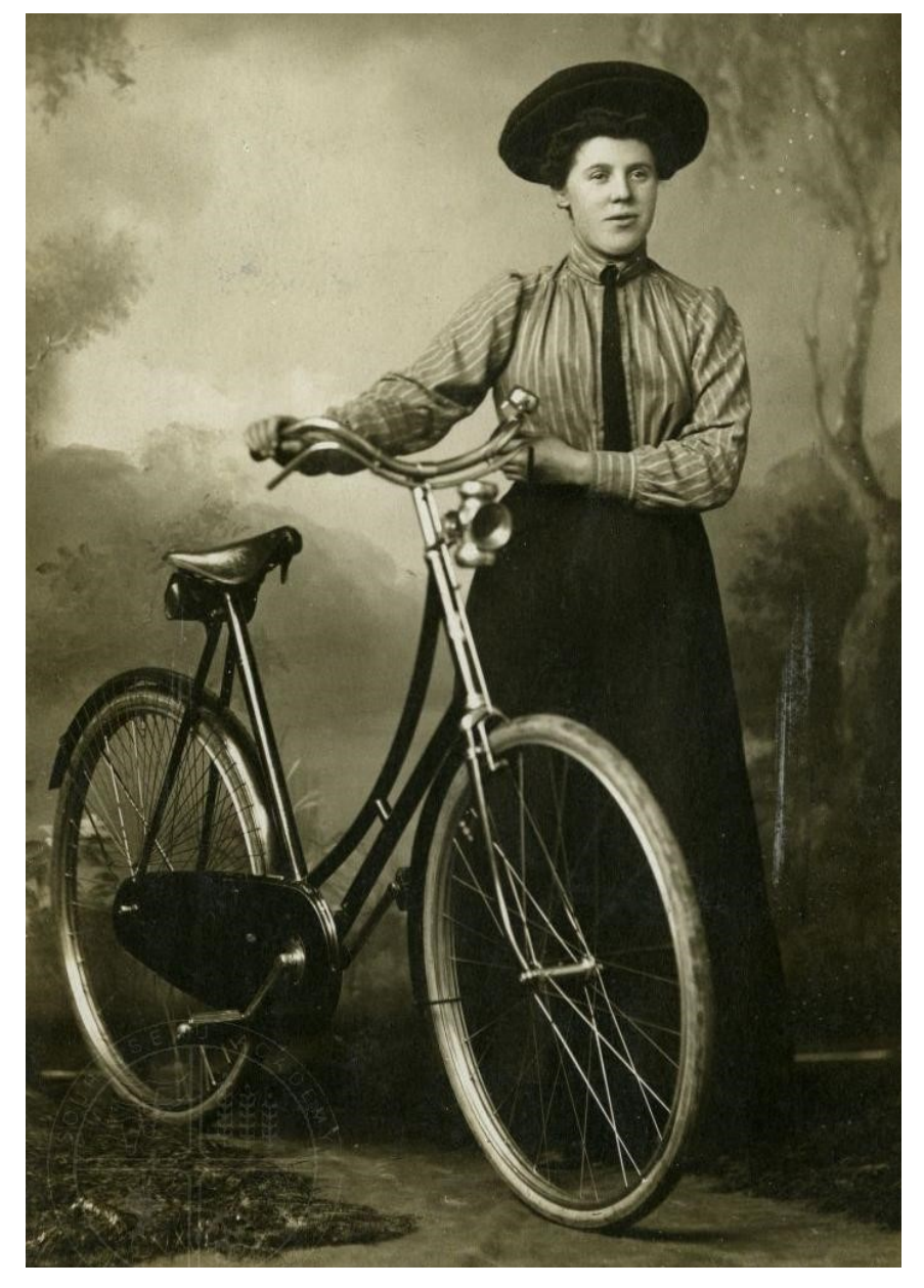
[23] Women Bicyclists. The introduction of the "safety bicycle" in the 1890s allowed more women to join in the fun. Women joined local cycling clubs, such as the Garden City Cycler's Club, and even started their own Ladies Cycling Club. This circa 1910 image shows a bicycle with a frame that was developed to accommodate a woman's skirt. Chain guards and spoke netting (as pictured here) were also available to prevent skirt entanglement. Many women took to wearing pant-like bloomers. However, that wasn't always looked upon as lady-like!