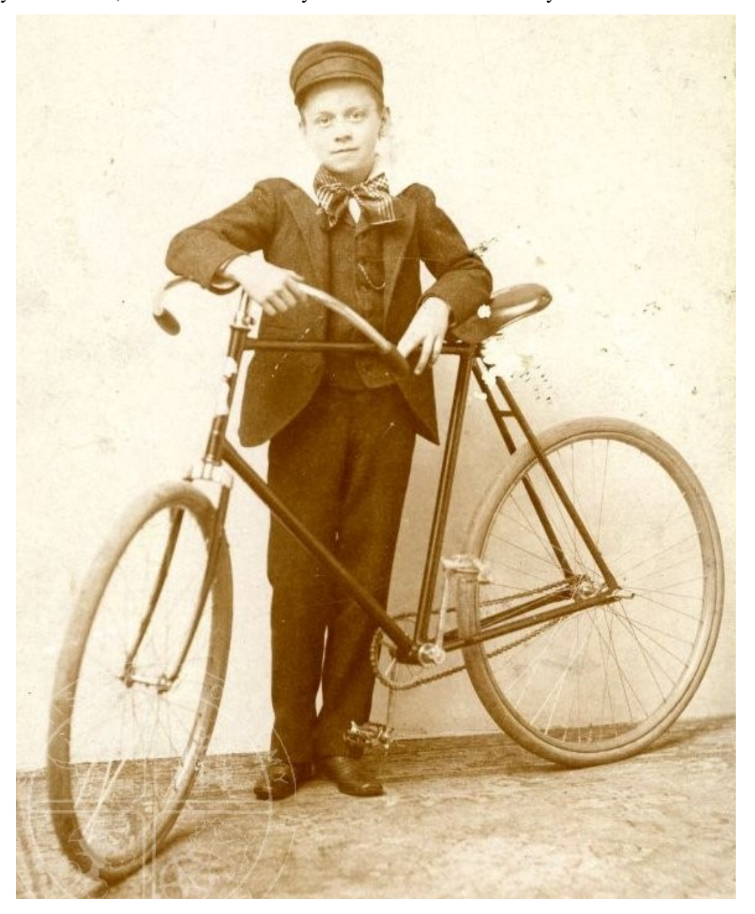
[19] Young Cyclist. For many children, their bicycles were their pride and joy. This 1890s cyclist appears to be a bit small for his bike, but he was likely a capable rider who had learned how to keep his bicycle well maintained.