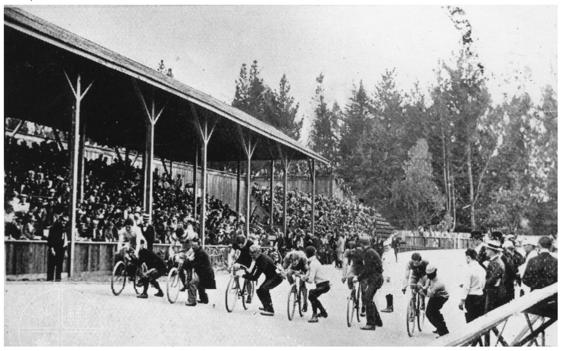
[20] Agricultural Park's Velodrome. Bicycle racing became a popular sport early on. In the 1880s (the high wheel era), cyclists would race at Agricultural Park's horse track on Race Street and The Alameda. Entering the "safety bicycle" era, tracks were built specifically for bicycles in San Jose during 1890 and 1892, and another built in East San Jose about the same time. Pictured above is the start of a race at the county's first "velodrome," which was built at Agricultural Park in 1895. Santa Clara Valley was well on its way to becoming a primary location for bicycle racing in California.