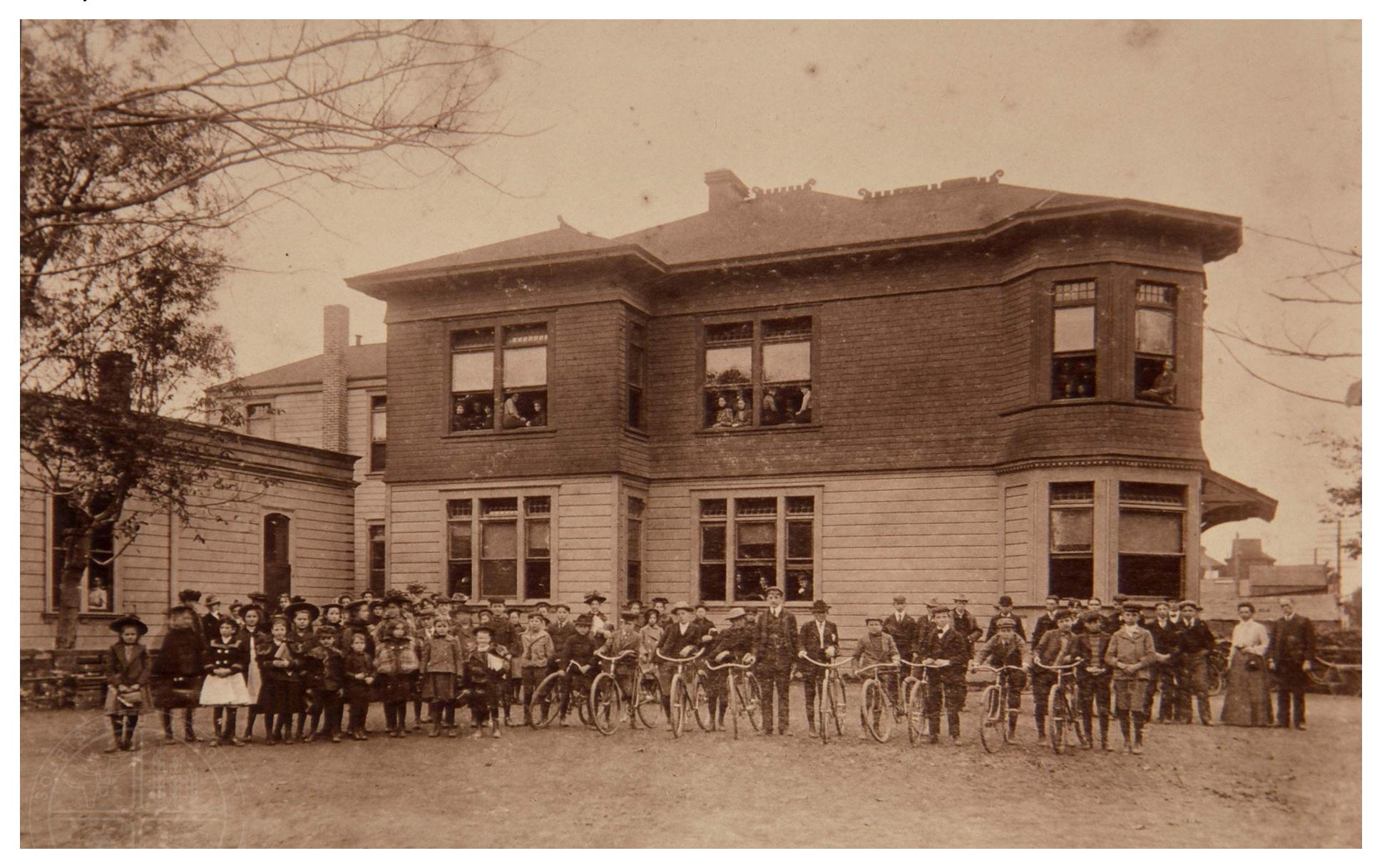
[18] Cyclists at Washburn School. The more affordable and safer "safety" bicycles allowed most everyone to become a rider. The Valley's level roads were well-suited for bicycling, and the "safety's" pneumatic tires offered a smoother ride than the earlier solid rubber tires. Shown here is a group of 1890s Washburn School students, many proudly posing with their bicycles. Washburn School was founded in 1894, and was located at the corner of San Pedro and Devine Streets.