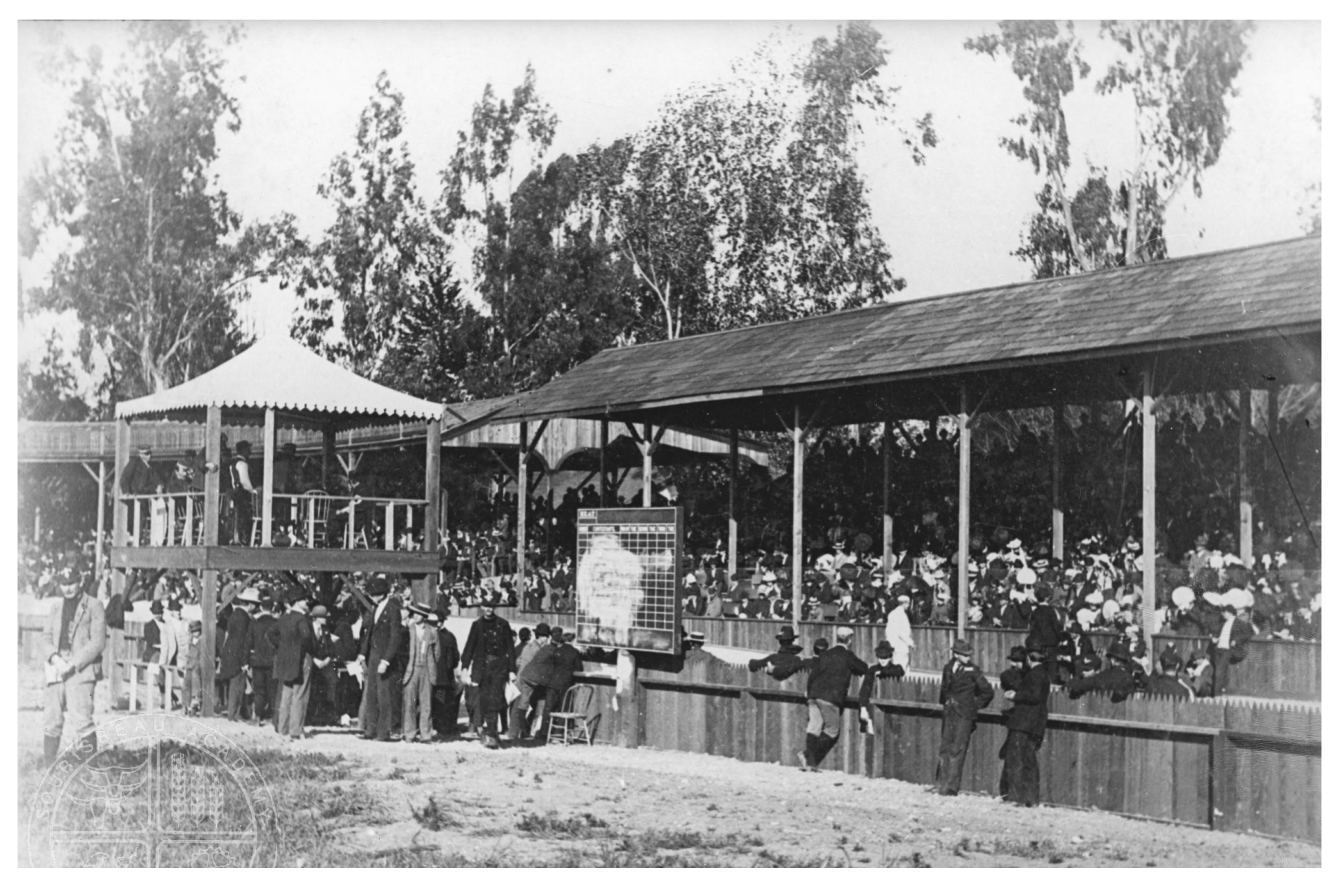
[21] Agricultural Park Velodrome, circa 1900. This photograph shows the official's observation tower and the grandstands of the 1895 velodrome at Agricultural Park. The one-third mile track was constructed at a cost of $9,000.00 and featured an ellipse-shaped cement track with curves banked at 20-degree angles. It was said to be "the best of its kind in the world."