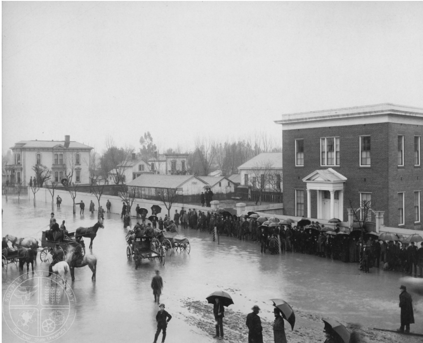
[47] Flood of 1890 - Throughout San Jose's history, floods have been a perennial challenge for Santa Clara Valley. In 1890, the Guadalupe River flooded much of the downtown area, as seen in this photo taken near West Santa Clara Street and what is now Almaden Avenue. Visible in the background to the right is the flooded campus of the College of Notre Dame.