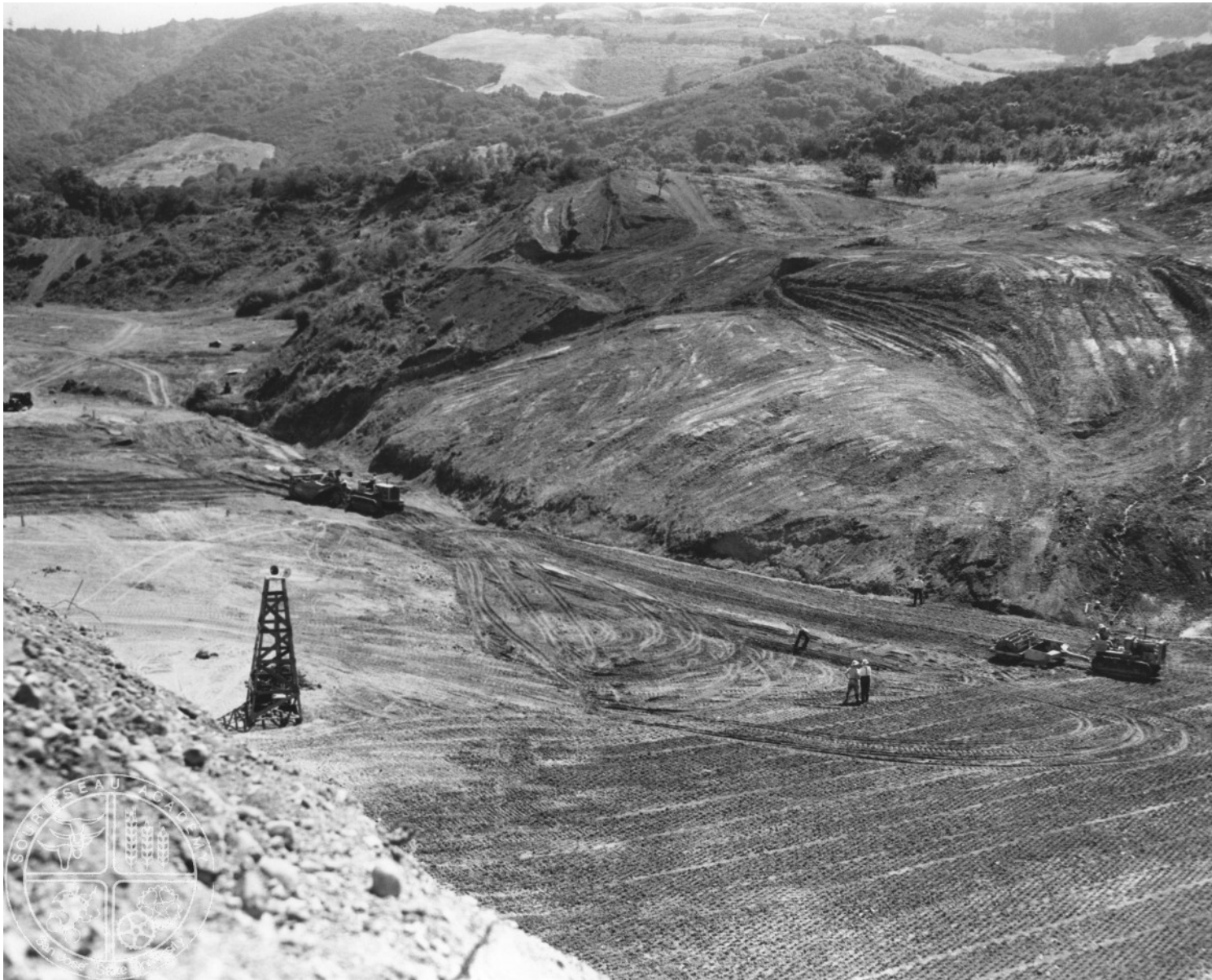
[55] Stevens Creek Reservoir - Stevens Creek Reservoir, shown here under construction in 1935, takes its name from the creek that ran adjacent to the Elisha Stephens homestead in what is now Cupertino. Stephens was a pioneer who arrived in 1844 after leading the first successful wagon train across the Sierra Nevada. Although his name is misspelled, it still commemorates a major road and this reservoir.