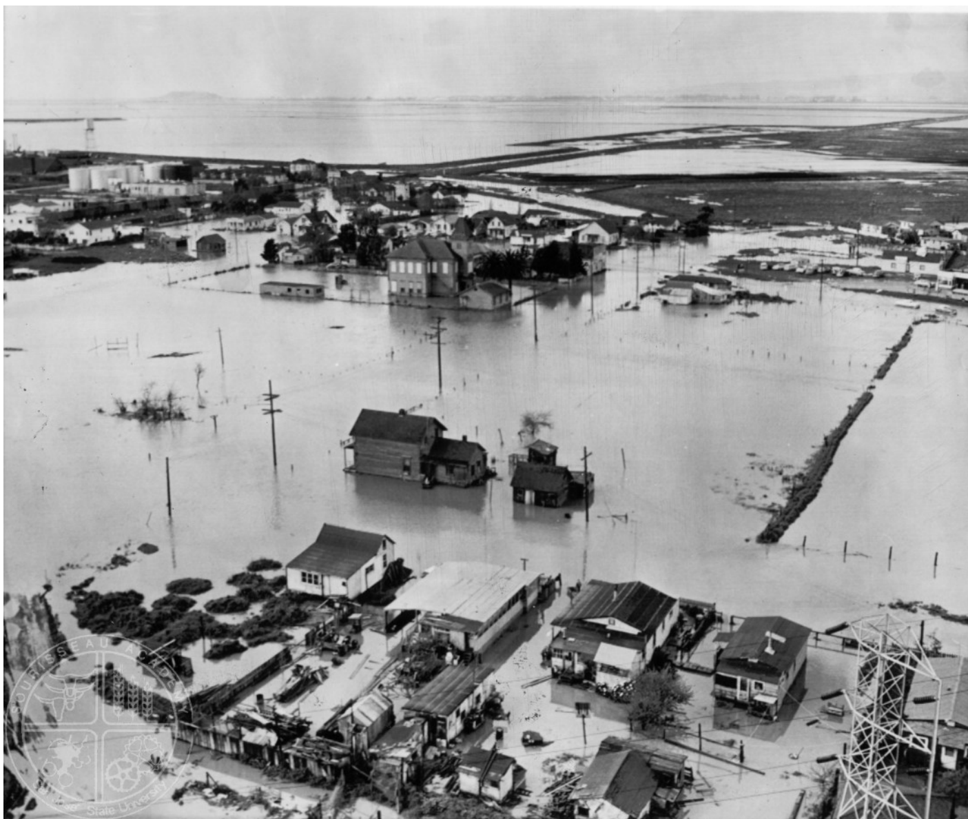
[50] Alviso Flooding 1958 - Alviso was hit particularly hard by continual flooding, including particularly severe ones in 1955, 1958, and 1983. Pictured here is the 1958 inundation of the town. Today, Alviso is a popular spot for bird watchers and other outdoor enthusiasts as it borders the Don Edwards National Wildlife Refuge. Although now protected by higher levees, the neighborhood confronts an uncertain future in the face of rising sea levels.