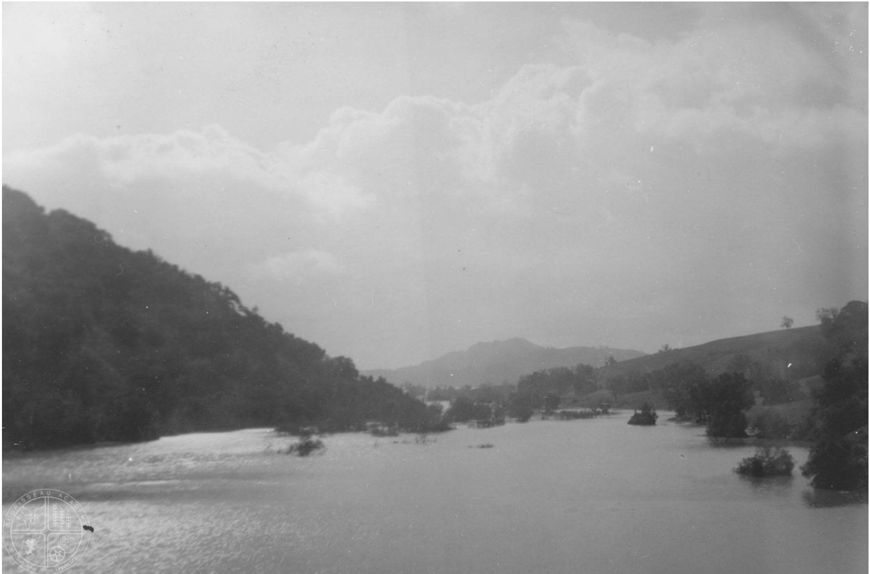
[57] Coyote Lake - This image was taken of Coyote Lake after its completion. The possible failure of the Coyote Lake and Anderson Lake dams in a major earthquake would prove disastrous for much of southern Santa Clara Valley. The 2017 flooding of Coyote Creek brought renewed attention to these risks.