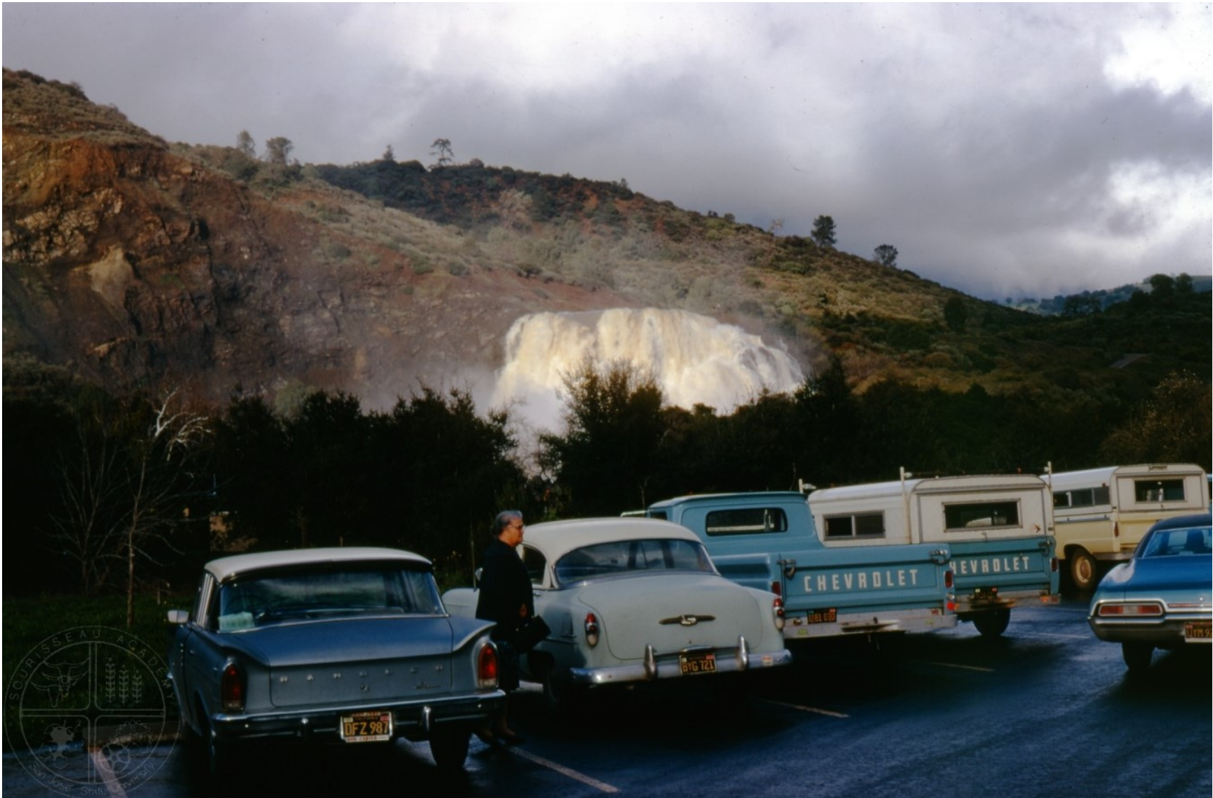
[58] Anderson Reservoir - Anderson reservoir and dam were completed in 1950, with a capacity greater than that of all of the other reservoirs in the county combined. In 1955, heavy rains sent water overflowing into Coyote Creek, captured in this dramatic image. A similar overflow in 2017 led to the disastrous Coyote Creek flood in downtown San Jose. Plans are currently underway to rebuild major portions of the dam to address the risk of overflow during heavy rains and earthquake damage. The construction of all these dams, meant to raise groundwater levels, helped to provide the necessary water resources to ultimately allow the extensive development of the Santa Clara Valley.