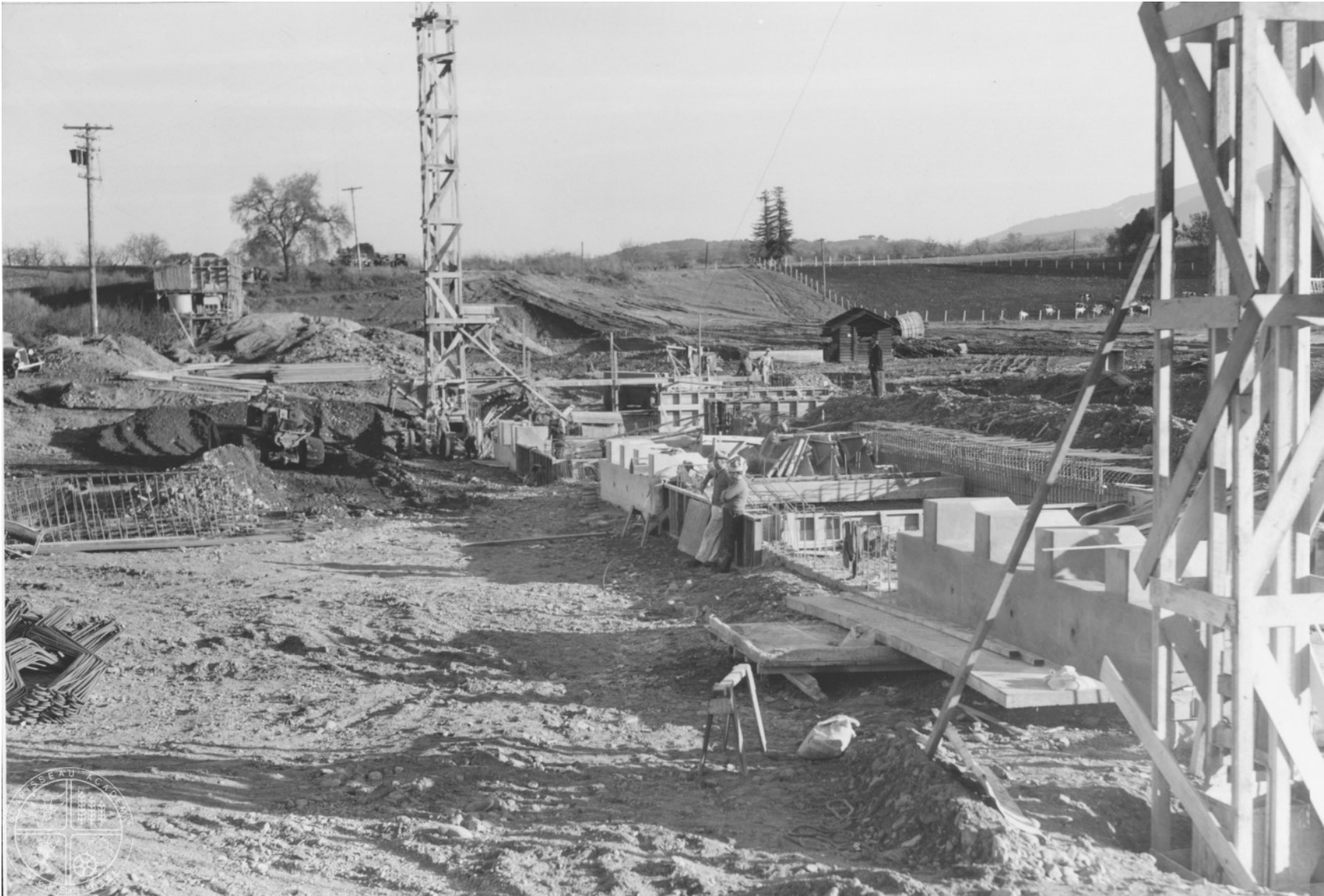
[53] Vasona Reservoir -The oldest and smallest of the reservoirs along Los Gatos Creek is Vasona Reservoir, which was one of the original reservoirs constructed under the authority of the Santa Clara Valley Water Conservation District in the mid 1930s. The reservoir forms the center of a popular park near downtown Los Gatos and is among the most frequented reservoirs in the Santa Clara Valley's watershed. Along with a number of smaller percolation ponds and Lexington Reservoir, Vasona plays an important role in the replenishment of the valley's water table.