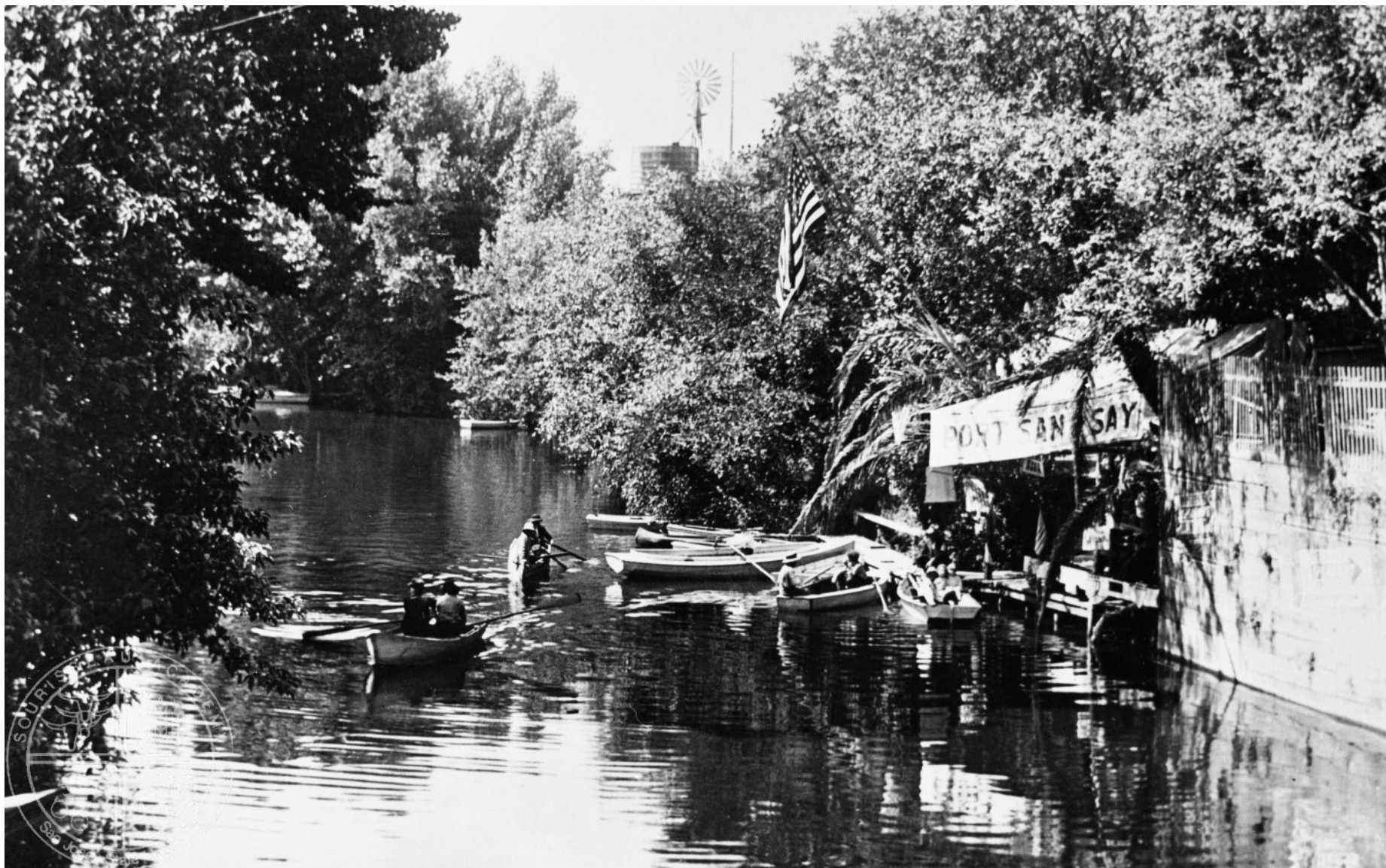
[46] Lake Monahan - In 1915, the Guadalupe River was briefly dammed to create a small lake, located between Santa Clara and San Augustine (now St. John) Streets. Known as "Monahan's Lake," after Mayor Thomas Monahan, it featured boating and other recreational activities. Although the venture was short-lived, efforts to revitalize the downtown portion of the Guadalupe River as a place for recreation led to the creation of the Guadalupe River Park and Gardens.