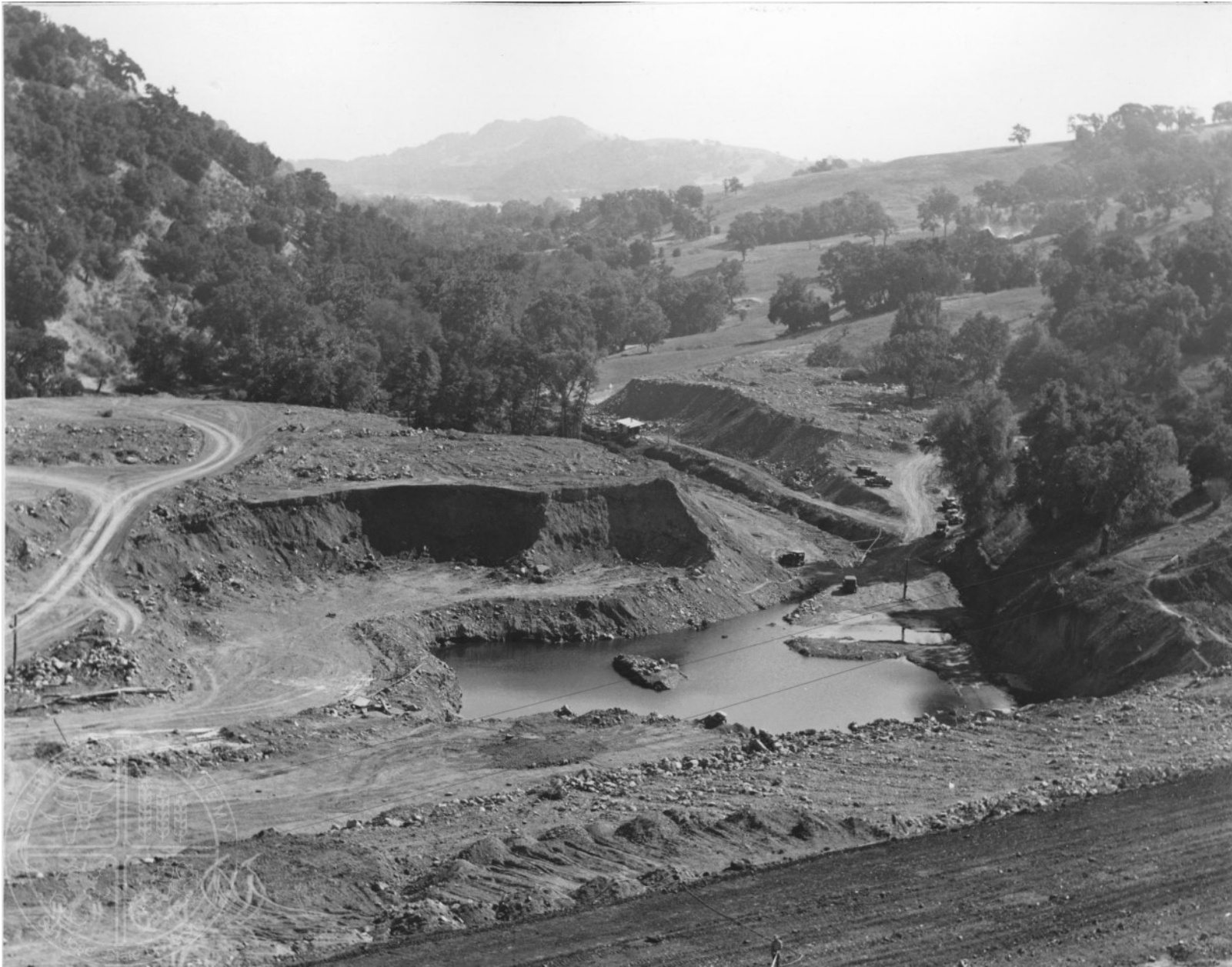
[56] Coyote Lake - The first and smaller of the two reservoirs along Coyote Creek, Coyote Lake was constructed between 1934 and 1936. Here we see the construction of the dam in 1935. The reservoir sits directly on the active Calaveras Fault.