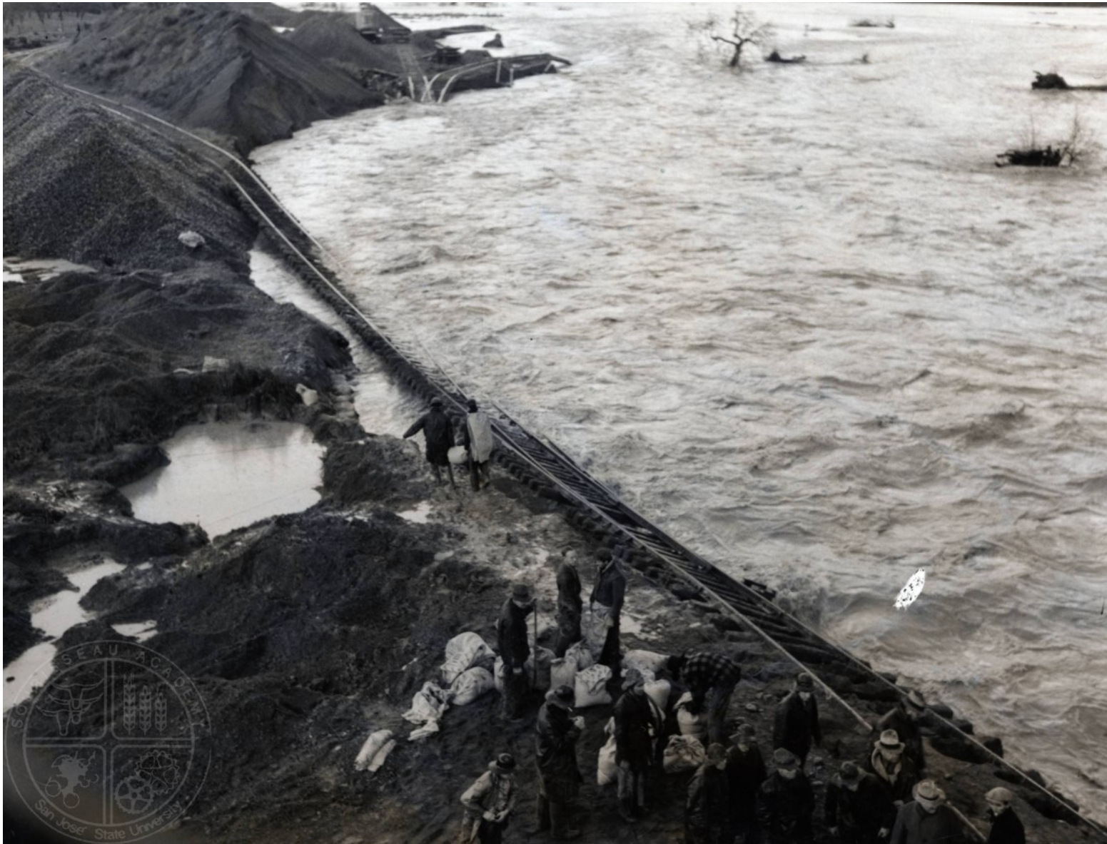
[51] Coyote Creek - Coyote Creek forms the eastern boundary of downtown San Jose. Like the Guadalupe River, the creek poses a continual flood risk to downtown, flooding repeatedly in the early part of the last century. During its most recent deluge in February 2017, Coyote Creek rose to its highest recorded level, breaking a record that had stood since 1922. Shown here is Coyote Creek flooding and damaging nearby railroad tracks in 1938.