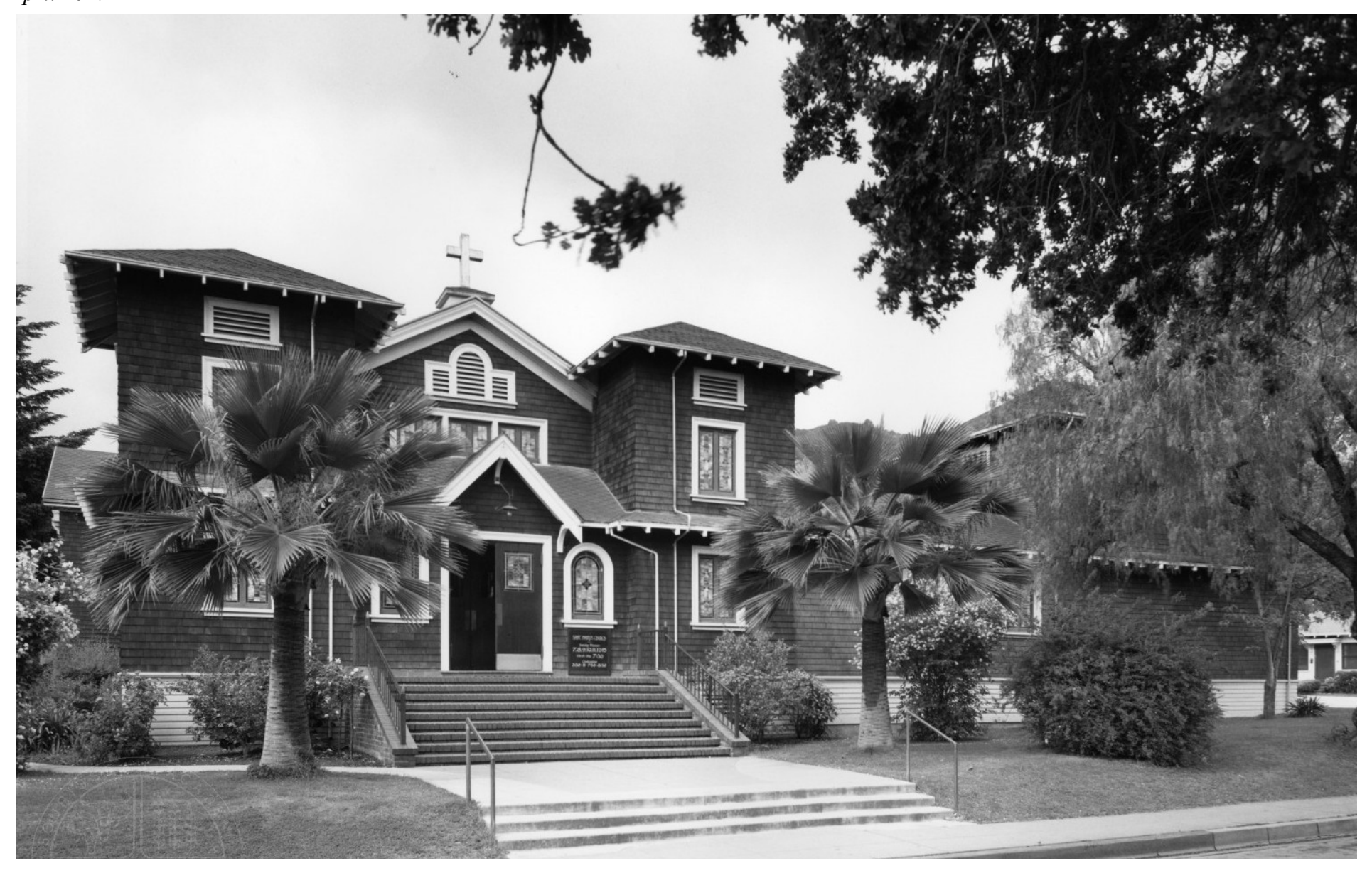
[54] St. Mary's Catholic Church, 1950. Saint Mary's Catholic Church was erected in 1881 at Bean and North Santa Cruz Avenues. In 1912, a new church was constructed at 219 Bean Avenue, the old church moved to the site where it served as the nave, and a rectory added in 1913. In 1914, San Jose architect Louis T. Lenzen designed a new front addition and facade, as shown in this photograph. The new addition included the vestibule, baptistery, and choir loft. In 1961, the 1914 church was demolished and a new, modern style church was constructed.