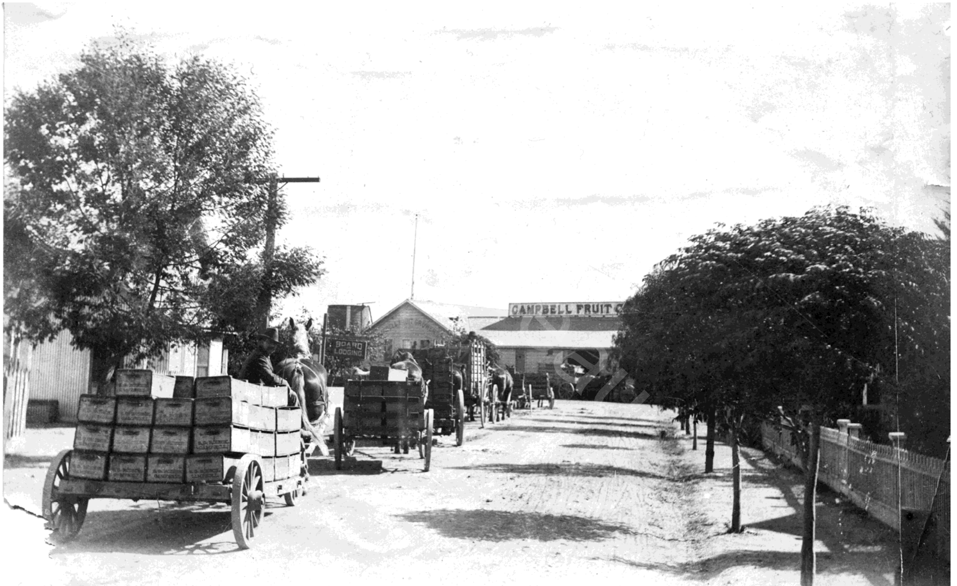
27) 1904: Wagons loaded with fruit from local orchards line up for delivery to the Campbell Fruit Company. Note the sign advertising board and lodging, an important service for workers who traveled to the Valley for seasonal work. The boxes are from a grower in Campbell, but the grower's name is illegible.

A photo recently purchased by Les Amis de Sourisseau! April, 2014